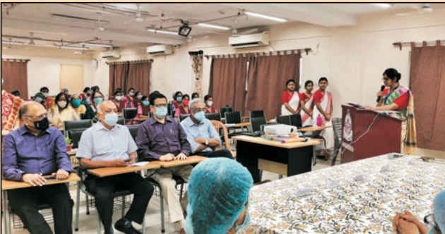
Welcome of Guests