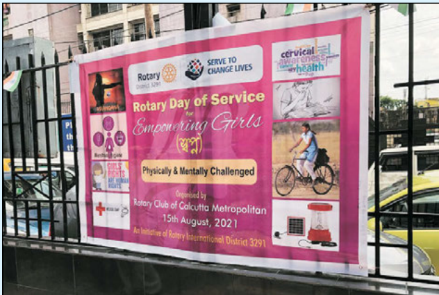
District banner for empowering girls at MSS