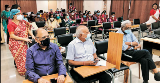
A view of nurses and members