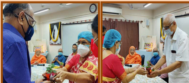
Felicitaton of the Dignitaries & honorable guests