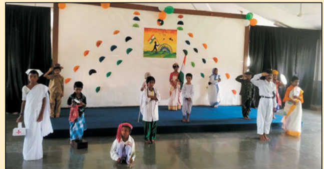
Participants of Go as you like