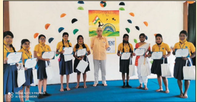
Secondary Students with their appreciation certificates on their success in secondary board exam