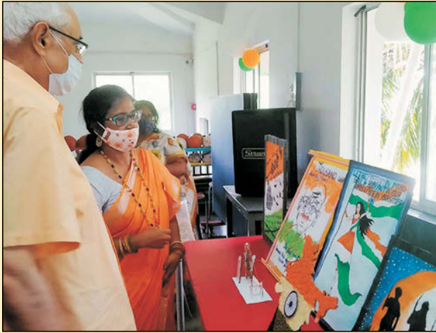
Students conveyed the message of freedom through the paintings