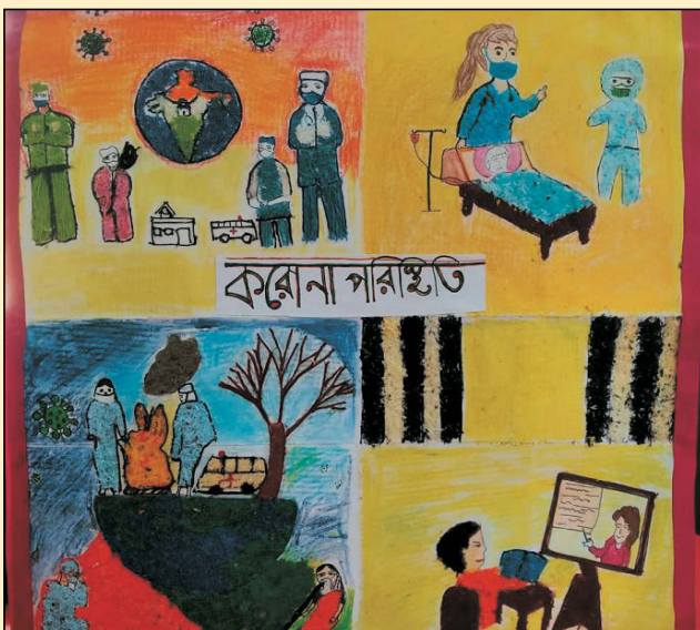
Craft work by VT Trainees