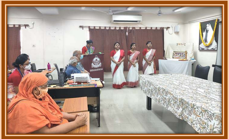
Vedic Chanting by Nursing students