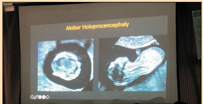
A view of the presentation