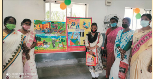
VT trainees showcasing creative artwork in the exhibition