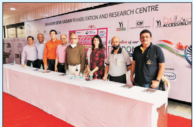
A view of attending RCCM members st MSS