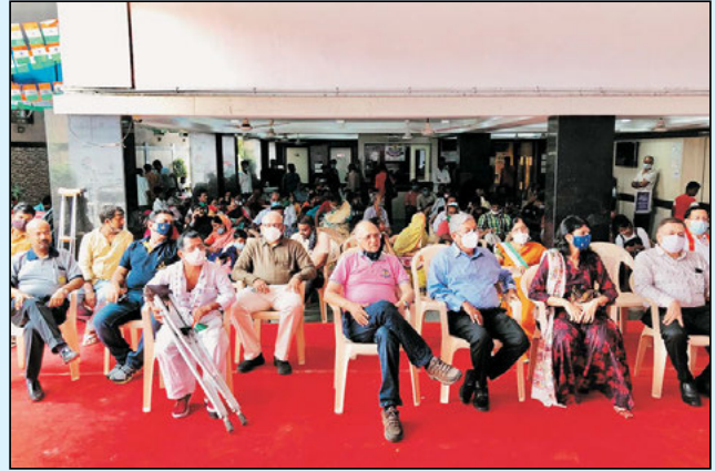
A view of audience with RCCM members