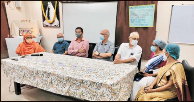
A view of Head table