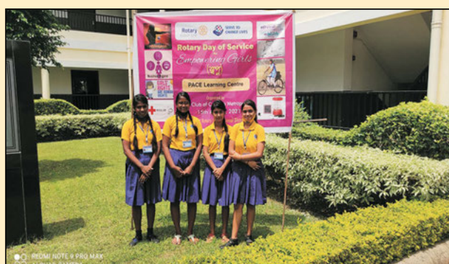
Girls of PLC in front of District banner of Empowering the Girls