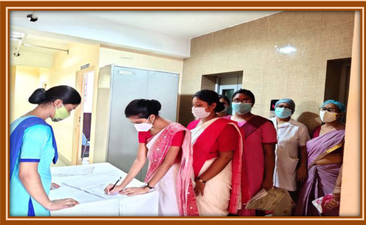
Registration and Reception of participants