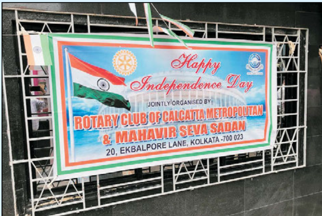
Banner of Celebration of Independence Day with Mahavir Seva Sadan